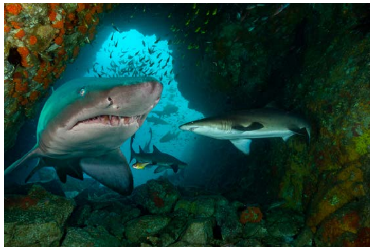
Grey Nurse Sharks at Fish Rock Cave