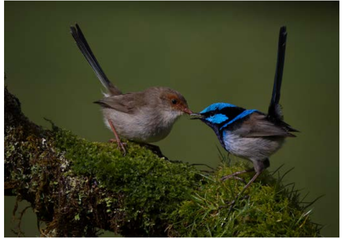
My Mate, Denis Hulme