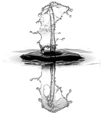
Parasol